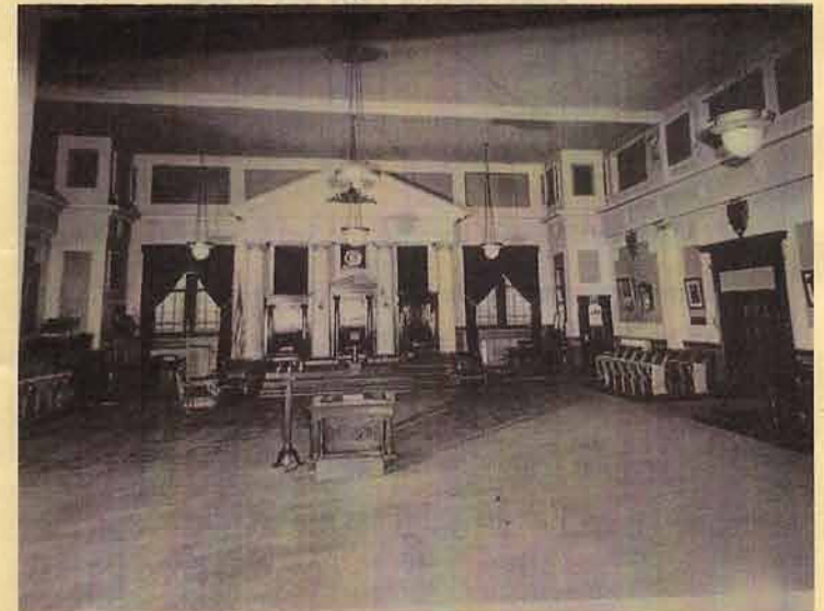
Examples of detailed craftsmanship of architectural elements